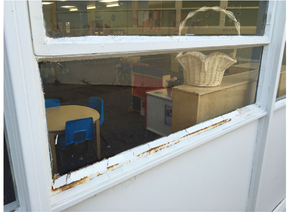
Single pane windows need to be replaced